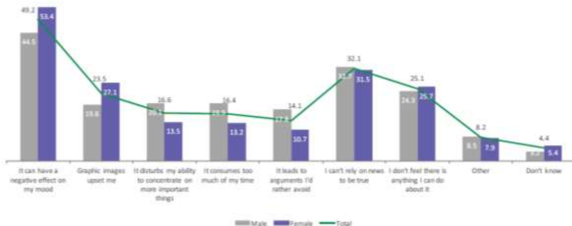
FIGURE 1.11: REASONS FOR AVOIDING NEWS (% OF ALL RESPONDENTS)

Q1dii_2017. You said that you find yourself trying to avoid news. Which, if any, of the following are reasons why you actively try to avoid news? Please select all that apply: It can have a negative effect on my mood; Graphic images upset me; It disturbs my ability to concentrate on more important things; It consumes too much of my time; It leads to arguments I'd rather avoid; I can't rely on news to be true; I don't feel there is anything I can do about it; Other; Don't know.