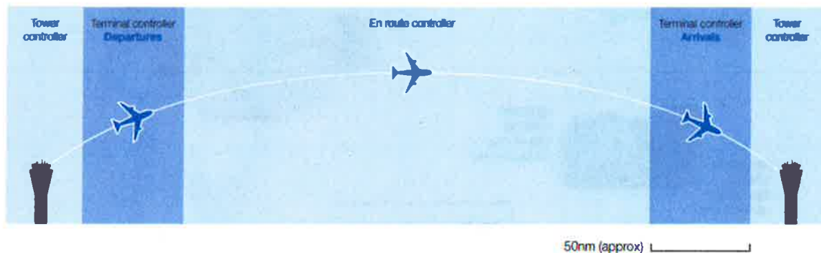
Graphic 1: Who controls the phases of flight.

Terminal control operations are currently provided from the two major Air Traffic Service Centres (ATSCs) in Brisbane and Melbourne, and four TCUs in Adelaide, Cairns, Sydney and Perth. The TCU integration project will relocate approach and departure control services currently performed across four locations into two.