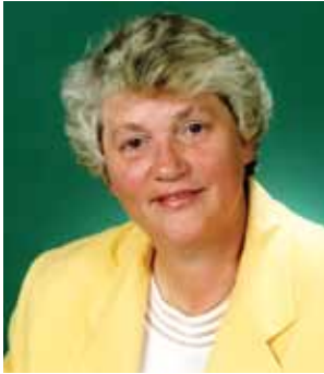
GASH, Joanna Member for Gilmore (NSW) Liberal Party of Australia