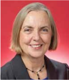
RHIANNON, Lee Senator for New South Wales Australian Greens