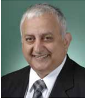
MELHAM, Daryl Member for Banks (NSW) Australian Labor Party