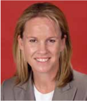
NASH, Fiona Joy Senator for New South Wales The Nationals