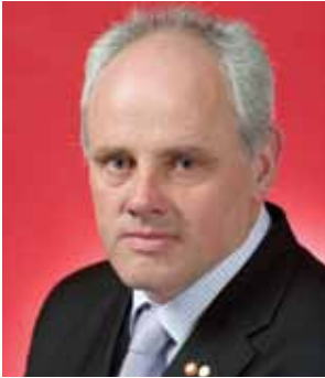
MADIGAN, John Joseph Senator for Victoria Democratic Labor Party