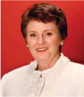
ADAMS, Judith Anne Senator for Western Australia Liberal Party of Australia