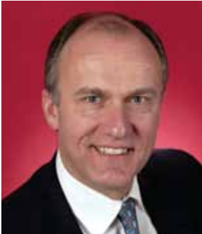
ABETZ, the Hon. Eric Senator for Tasmania Liberal Party of Australia