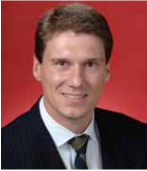
BERNARDI, Cory Senator for South Australia Liberal Party of Australia