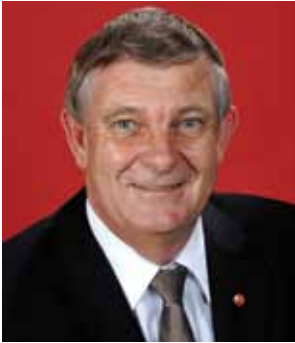
BACK, Christopher John Senator for Western Australia Liberal Party of Australia