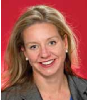
McKENZIE, Bridget Senator for Victoria The Nationals