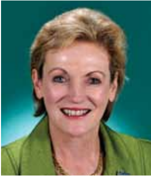
PRENTICE, Jane Member for Ryan (Qld) Liberal Party of Australia