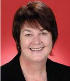
McEWEN, Anne Senator for South Australia Australian Labor Party