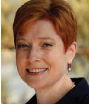
PAYNE, Marise Ann Senator for New South Wales Liberal Party of Australia