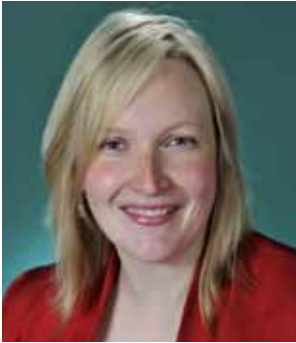
SMYTH, Laura Mary Member for La Trobe (Vic.) Australian Labor Party