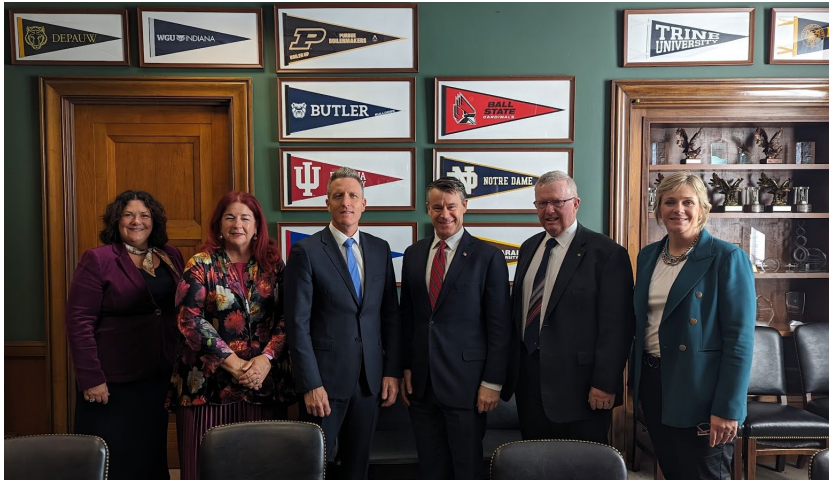
Delegates with Senator Todd Young, the Senior Senator from Indiana.