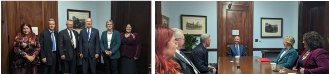
Left: Delegates with Senator Pete Ricketts, the Junior Senator from Nebraska. Right: Senator Ricketts leading a discussion with the delegates in his office.