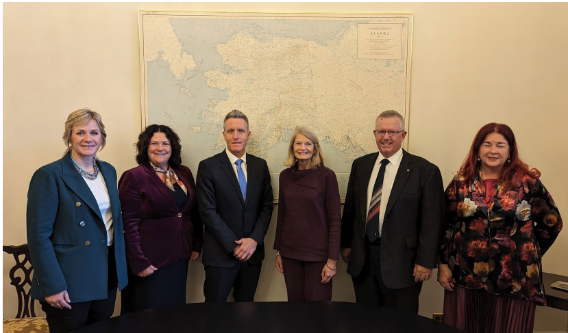
Delegates with Senator Lisa Murkowski, the Senior Senator from Alaska.