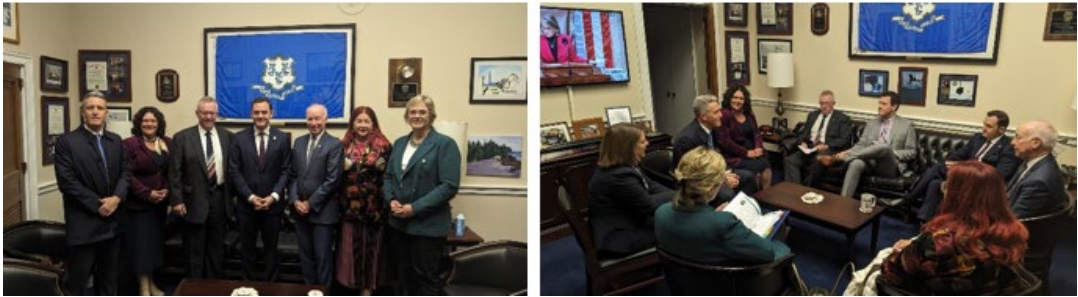
Left: Delegates with Representatives Joe Courtney and Mike Gallagher, the Co-Chairs of the Friends of Australia Congressional Caucus and AUKUS Working Group. Right: Delegates during a discussion with Representatives Courtney and Gallagher.