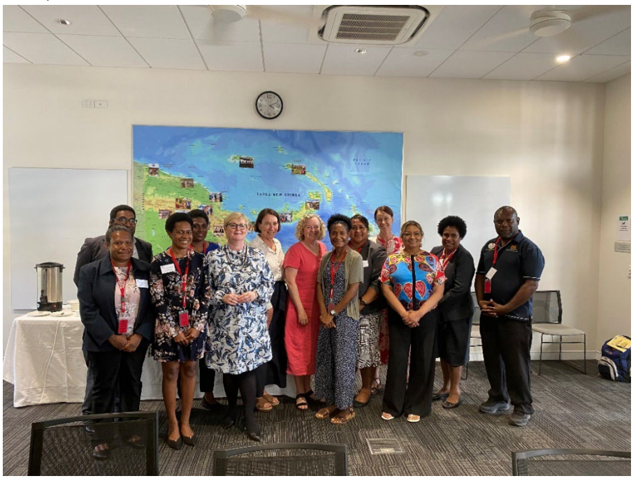
Australia Awards recipients and alumni with the delegation

The delegation also met with local recipients of Australia Awards Scholarships who shared their experiences and how they benefited from the opportunity to pursue further study in Australia. Recipients of the awards are taking up leadership roles within their chosen fields in both the government and private sectors.