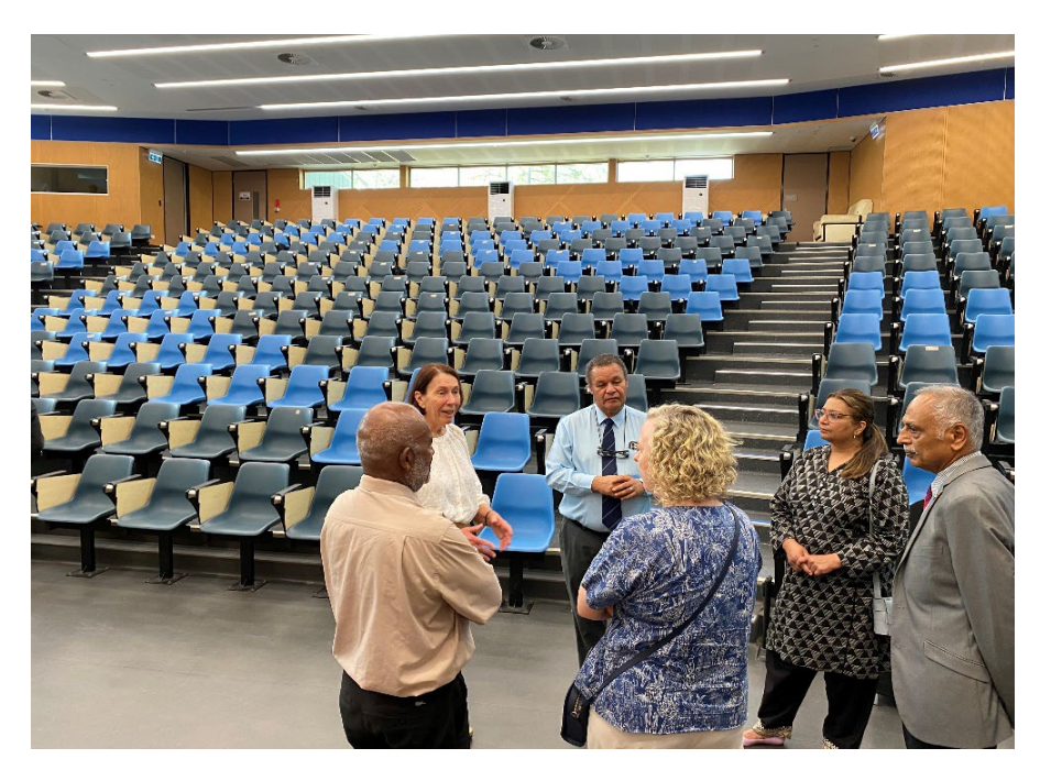
Delegation members inspecting new lecture facilities with representatives of the University of Papua New Guinea.

The delegation was pleased to hear that the number of female students had been steadily increasing and discussed some of the broader challenges facing the university, including replacing ageing buildings and infrastructure, attracting and retaining appropriate staff to meet greater student demand, securing funding certainty and ongoing financial sustainability and strengthening financial management and audit processes.