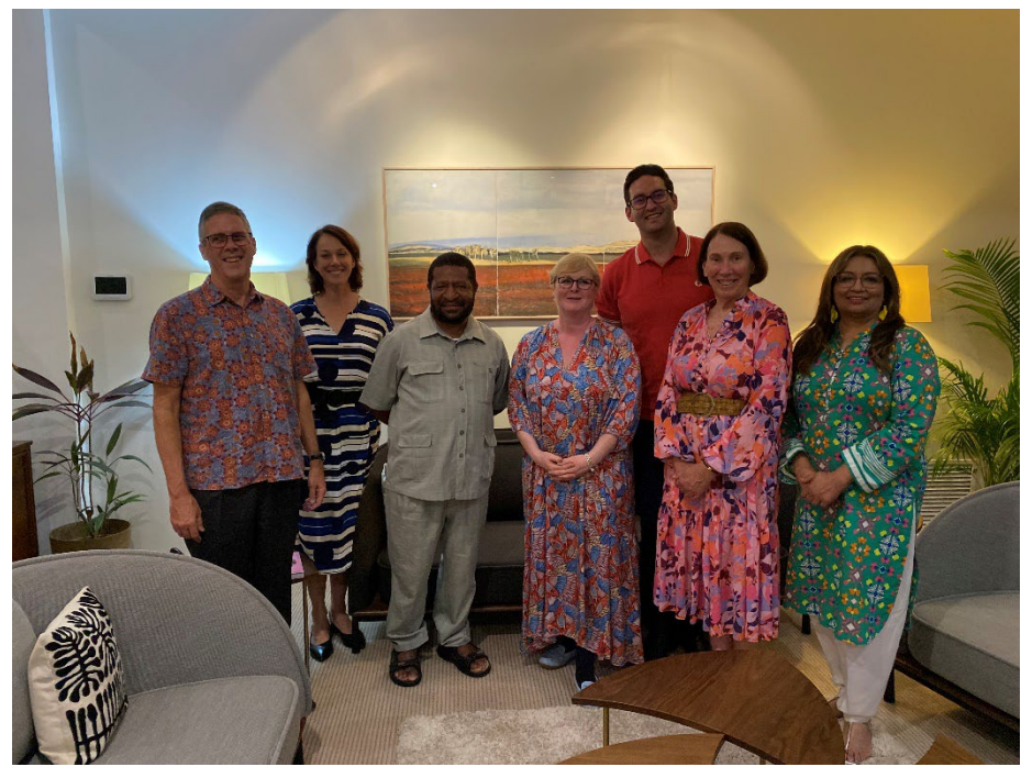
Members of the delegation with the Hon Saki Saloma, Member for Okapa Open, and HE Mr Jon Philp, Australian High Commissioner.

Topics discussed over dinner included challenges in increasing female representation in the PNG Parliament and politics more generally, and the importance of the Connect PNG Program<sup>1</sup> to realise economic and social development opportunities through the construction of road and port infrastructure.