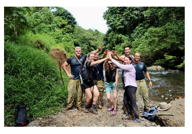
The delegation with Kokoda Track Authority guides, members of the Australian Defence Force stationed in PNG and a DFAT official prior to walking from Owers' Corner to Goldie River.

As a result of participating in the walk, members of the delegation expressed a greater appreciation for the suffering and sacrifices made by those who served in the campaign and agreed that participating in the walk was an important contributor to their understanding of the bilateral relationship between PNG and Australia.