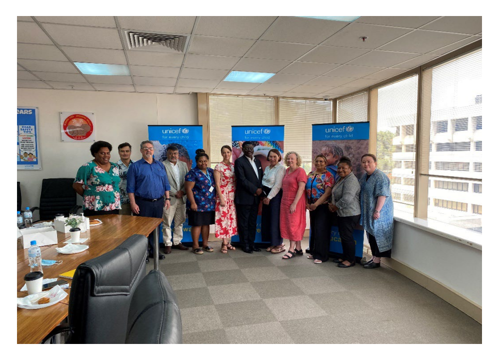
Members of UNICEF PNG and the Australian High Commission with members of the delegation.

The delegation was keen to explore what could be done to improve the completion rate of students at Grade 12 level as there appears to be a consistent withdrawal from formal education across most year levels. UNICEF representatives indicated that limited access to secondary schools was an issue for many students once they reach that level. While some of the access can be attributed to secondary schooling not being locally available, it was also noted that community violence (particularly in the Highlands) following the 2022 national election had also closed some schools for significant periods of time and this was having an impact on student attendance and attainment.