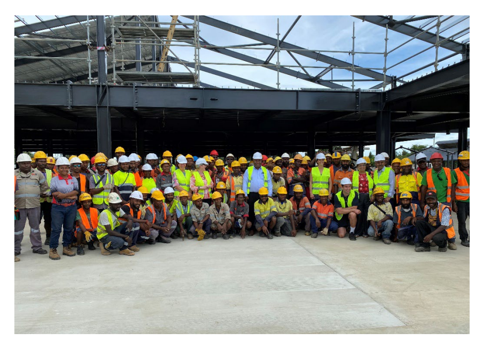
The Kimbe Market Development project is employing and upskilling many local construction workers.

The delegation was impressed by the large number of local tradespeople employed in the construction phase and the opportunities that the project has given them to improve their skills and competency. The Governor emphasised the importance of projects like the Kimbe Market Redevelopment to building capability and capacity within the local workforce.