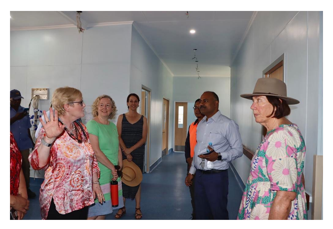
The delegation touring the new Bitokara Community Health Post with the Governor of West New Britain, the Hon Sasindran Muthuvel MP (second from the right).