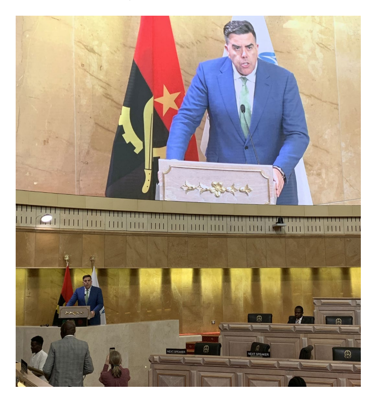
Mr Speaker making his contribution to the General Debate

In relation to diversity, equality, and inclusion in the parliamentary workplace, Mr Speaker highlighted the record number of women elected to the Australian Parliament in 2022, with the upper house becoming a female-majority chamber for the first time in Australia's history.