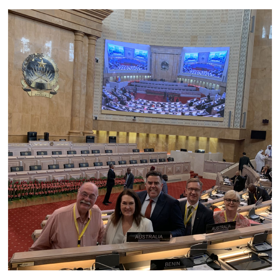
The Australian delegation at the 147<sup>th</sup> IPU Assembly