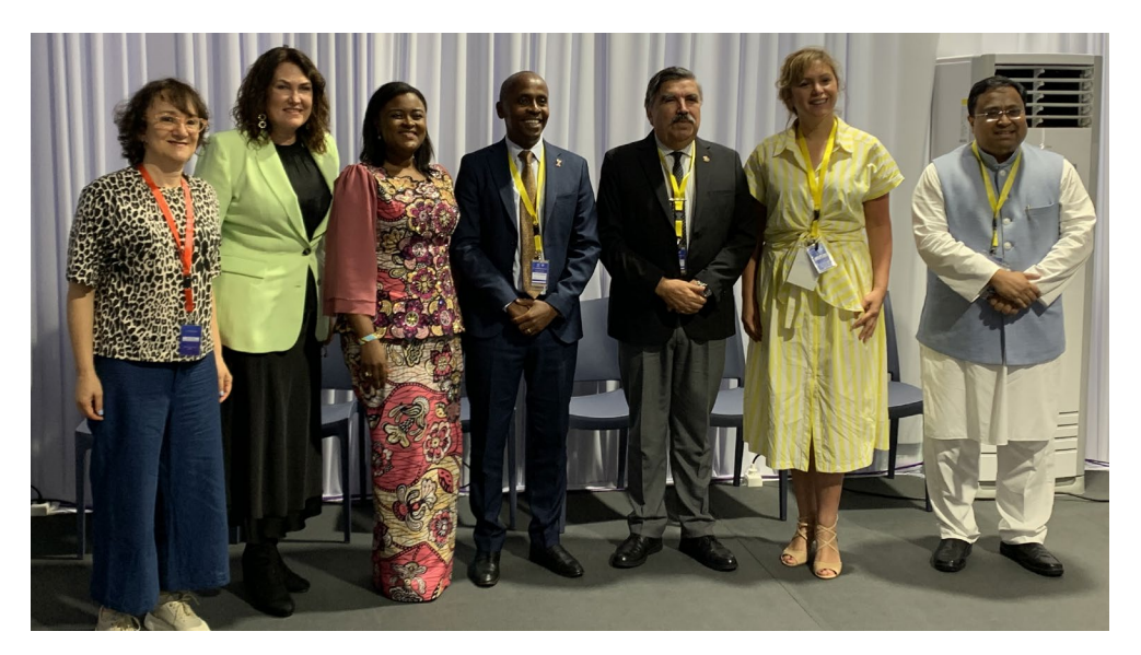
Senator O'Neill and fellow members of the Committee to Promote Respect for International Humanitarian Law

The committee held a second, open meeting on 26 October to debate the theme: The role of parliaments in tackling the humanitarian impacts of climate-related displacement.