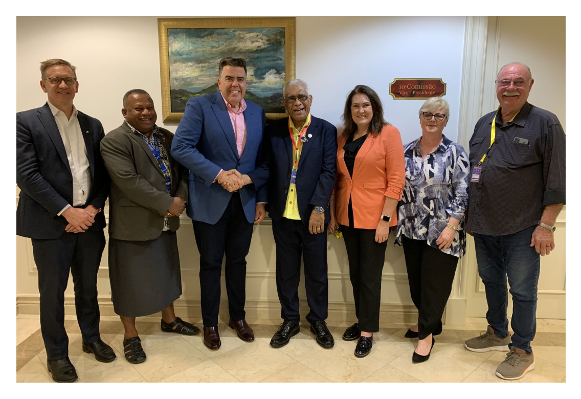
Australian delegation led by Mr Speaker meeting with the Fiji delegation led by the Hon Ratu Naiqama Lalabalavu, Speaker of the Parliament of the Republic of Fiji