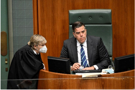
The Clerk offering advice to the Speaker

There are two Clerks at the head of the Table of the House, immediately in front of the Speaker's Chair. The Clerk of the House sits on the Speaker's right. The Clerks can be distinguished from Members by their black gowns (until 1995 they also wore wigs, similar to those worn by barristers).