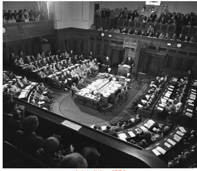
Joint sitting 1974

Senators are elected from 1 July for a fixed period of six years (except those representing the territories, who serve three years with their terms tied to the House of Representatives elections). Every three years half the membership of the Senate stands for election. When the House expires, or is dissolved in normal circumstances, the Senate continues to exist as Senators remain in office until the completion of their term and only half stand for election at any one time. The Senate can only be dissolved in accordance with the double dissolution provisions of the Constitution, described below.