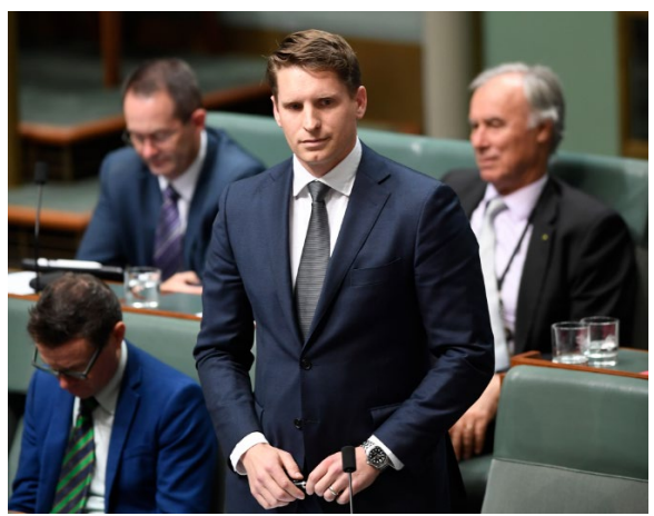
Backbenchers in the House

A Member is expected to be a spokesperson for local interests; an ombudsman and facilitator who deals with concerns about government matters; a law maker; an examiner of the work of the government and how it spends the money it raises from taxation; and a contributor to debates on national issues. If a Member has been elected with the support of a political party (as most are), they are also expected to participate in party activities.